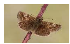
Dingy Skipper Butterfly