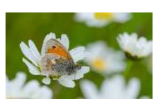
Small Heath Butterfly