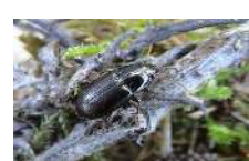
Wormwood Moonshiner Beetle