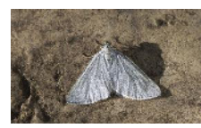
Grey Carpet Moth

Can you find the following species in this project: