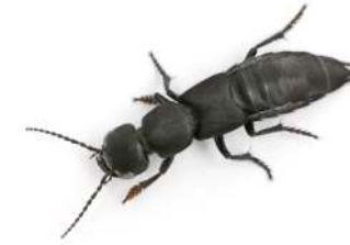
Devil's coach horse beetle

Other beetles that may be mistaken for stag beetles: